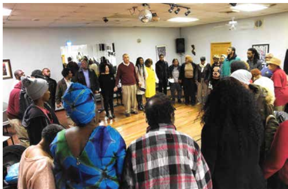
Circle of Love at UAPO Meeting February 7, 2017