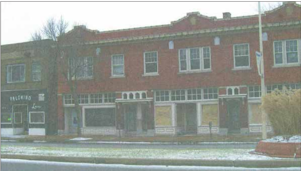
5878-82 Delmar (Across from Loop Trolley)

Another Case for Reparations? You Decide? Reporting from the Front Line... Ya'll Better Get On Board with the 144,000 Movement.