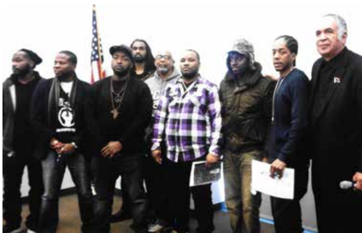
Young Brothers Joining UAPO at Men's Day Program January 14, 2017