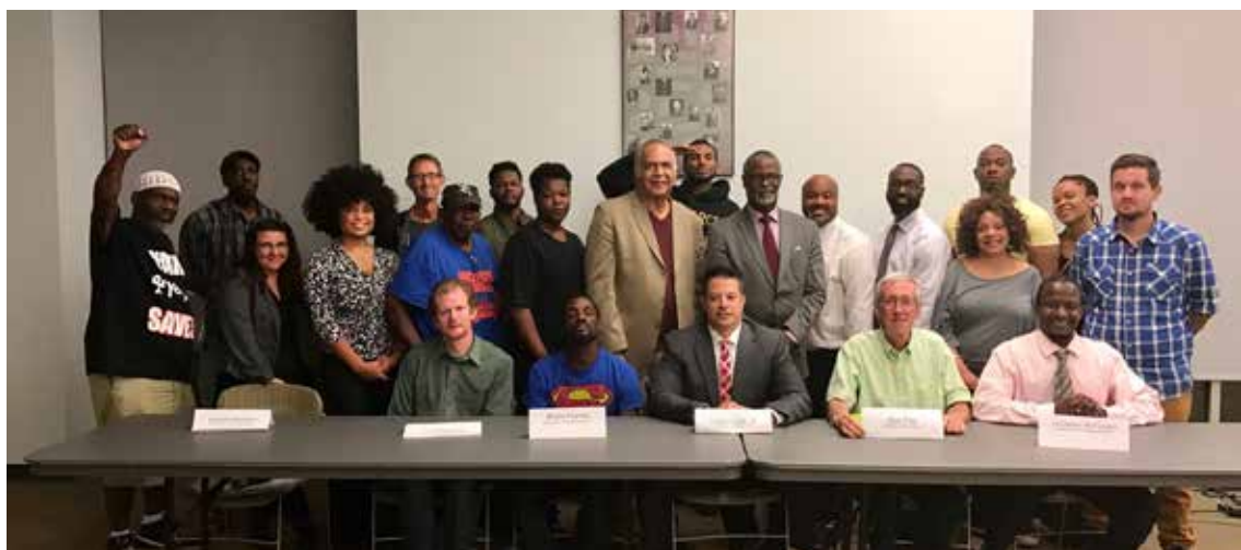
Participants at Political Forum November 2016