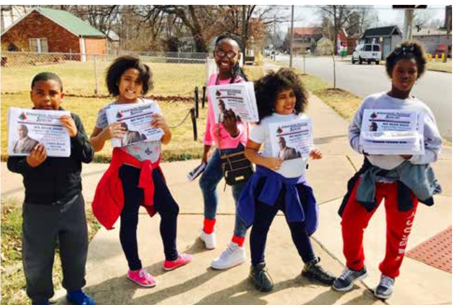
Young People Excited About the African NewsWorld